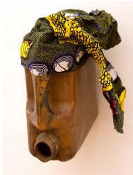
Wax Bandana Romuald Hazoum   2009

Americanah , on the surface is a love story between Ifemelu (the primary protagonist) and Obinze that crosses continents, years of separation, and the inevitable reunion of lovers. However, beneath the love story is a tale of migration, transformation, transnationality, and transcultural experience. Wax Bandana in a similar fashion though perhaps more discretely, too challenges the viewer to consider the transcultural