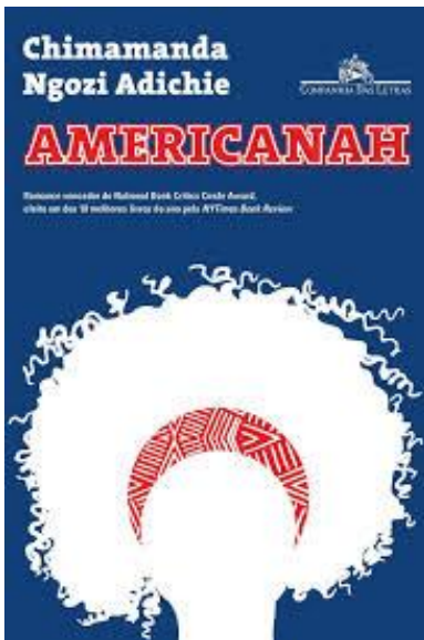
Americanah Chimamanda Ngozi Adichie 2013

The question of what is “transnational identity”, and more specifically, how is it prescribed, diagnosed, and presented in non-Western literature and the visual arts is drawn to the foreground throughout this essay enabling an engagement with the question, or rather, the problematic of transnational representation in literature and the visual arts - arguing against any notion of a “fixed” position, or hybridization of identity – presenting in its stead a space of “eccentricity” and “cultural overlap”. This essay presents a specific case study of transnational identity in two works: Americanah (2013) by Chimamanda Ngozi Adichie of Nigeria, and Wax Bandana (2009) by Romuald Hazoum   of Benin; literature and sculpture respectively.