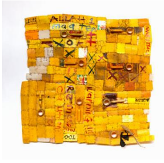
Serge Attukwei Clottey Trials and Tribulations