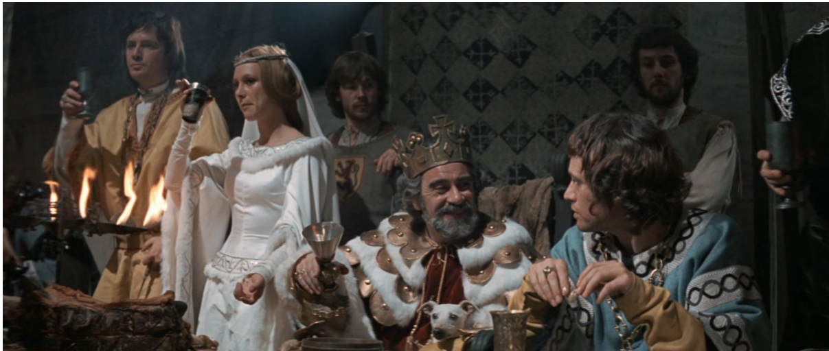
Figure 9: King at the banquet

We last see the King Duncan bare-chested in his bed which shows his weakness and vulnerability as Macbeth ends his life.