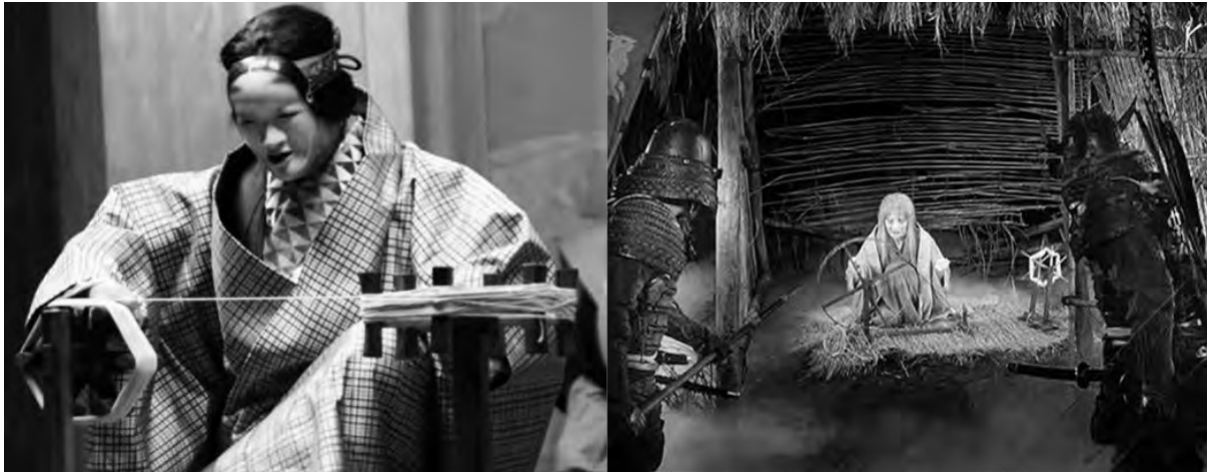
Figure 13: An old woman in Throne of Blood.

Both Polanski and Kurosawa presented that scene very well, but Kurosawa's version is more memorable, probably because it is more surreal and intense with a special focus on facial expressions. Noh masks were used as an inspiration for the spirit's expressions.