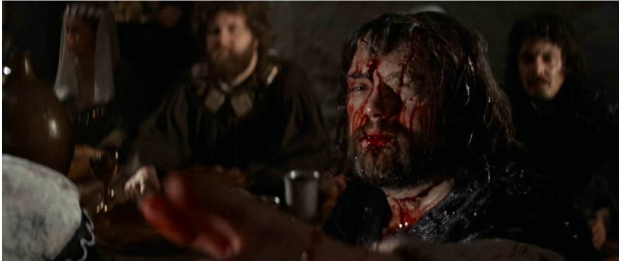
Figure 7: Banquo's ghost