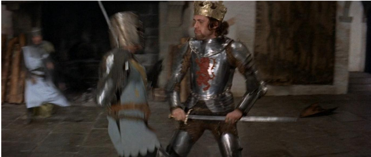
Figure 3: Macbeth's duel (Source: Polanski, Macbeth, 1971)