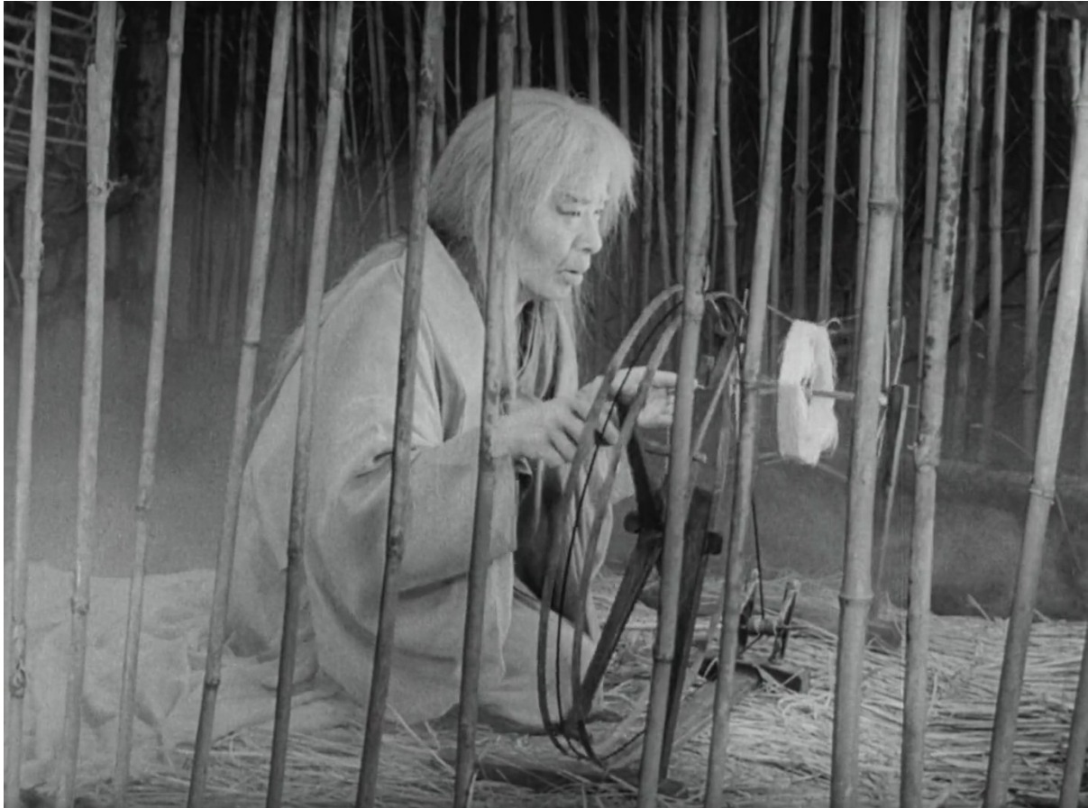
Figure 12: The spirit with the wheel (Source: Kurosawa's Throne of Blood , 1957)

Characters' costumes are a crucial part of film analysis. They not only add to the quality of the film but create a crucial part of the character and their spatial and temporal setting. After introducing characters and describing their costumes and their importance I will present and analyse five major scenes from both films and compare them. I will also point out certain scenography details important for the storyline. I will also compare the scenes from the two films and use other authors' observations that helped me compensate for the parts I missed while watching these films. To make my report full, I will occasionally add images of shots from the film to make my statements and comments more sensible.