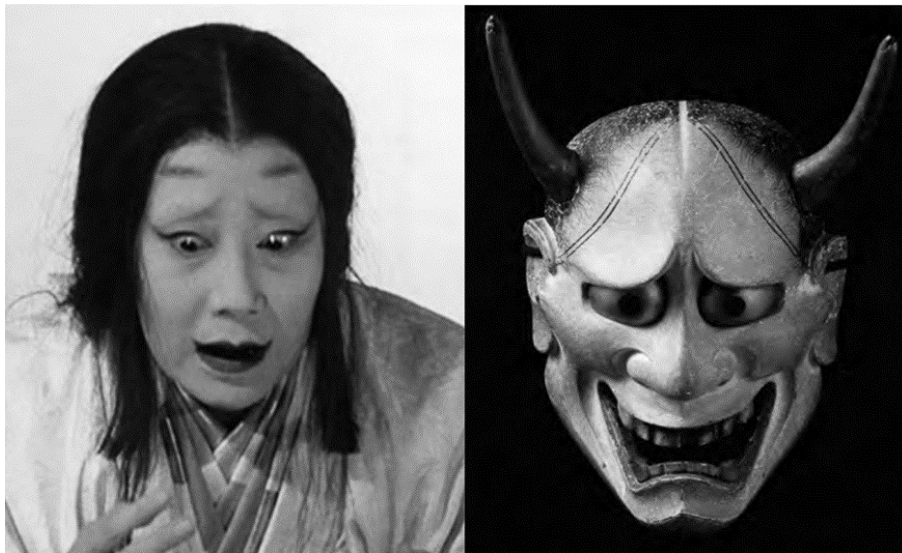
Figure 2: Hannya mask

Fujaki mask shown in the picture is used to show the sorrow of a woman who lost her child.