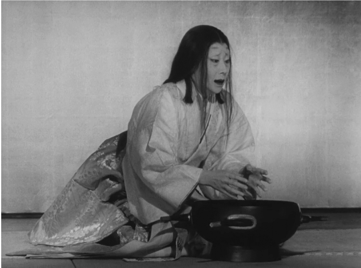
Figure 6: Asaji (Source: Kurosawa's Throne of Blood , 1957)