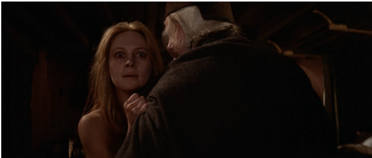
Figure 15: Lady Macbeth with the physician

Another interesting and genius part of the scene is its ending when Lady Macbeth goes back to bed. The front side of her naked body is conveniently covered up by the physician who is helping her walk to bed. This is a very intelligent way to show the character's vulnerability without showing too much of the actress's skin.