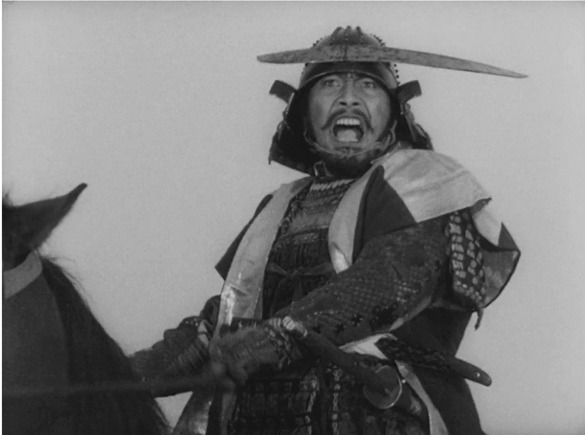
Figure 4: Washizu

Washizu's acting style is full of sudden movements and exaggerated facial expressions are in contrast with expectations from a samurai. His temper plays a big role in his character development and is used as one of the main plot devices.