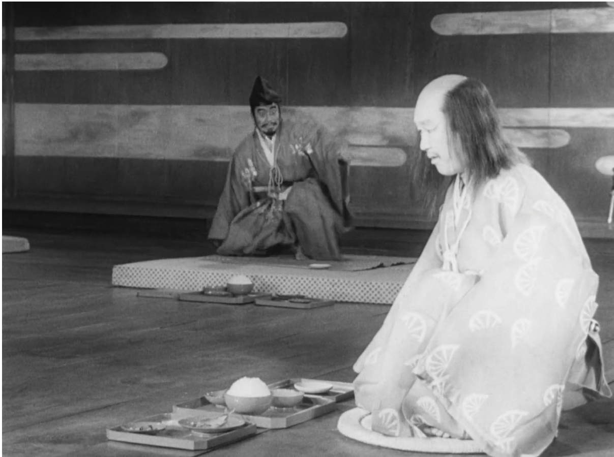
Figure 8: Miki's ghost (Source: Kurosawa's Throne of Blood , 1957)