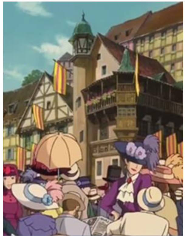
1.2. Hayao Miyazaki, Studio Ghibli, Howl's Moving Castle