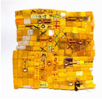
Serge Attukwei Clottey Trials and Tribulations Plastic and Wire 2015