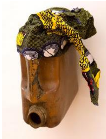
Wax Bandana Romuald Hazoumé 2009

Americanah , on the surface is a love story between Ifemelu (the primary protagonist) and Obinze that crosses continents, years of separation, and the inevitable reunion of lovers. However, beneath the love story is a tale of migration, transformation, transnationality, and transcultural experience. Wax Bandana in a similar fashion though perhaps more discretely, too challenges the viewer to consider the transcultural