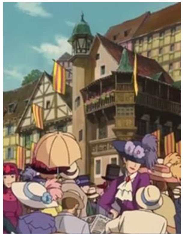
1.2. Hayao Miyazaki, Studio Ghibli, Howl's Moving Castle