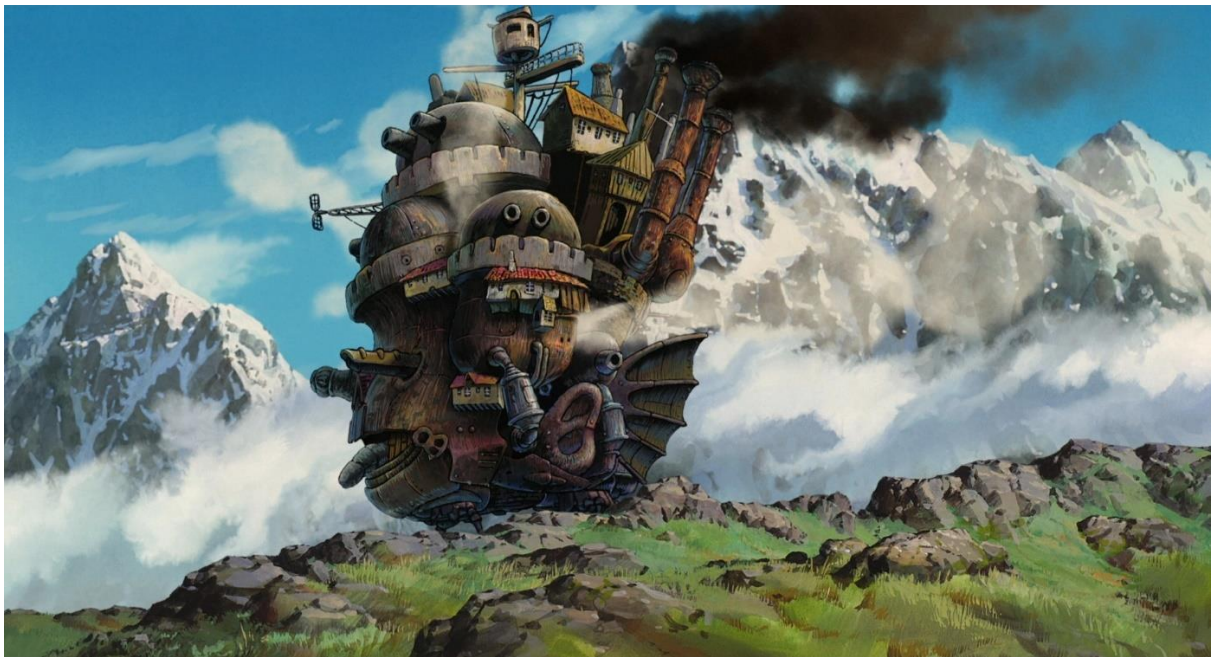
1.3. Hayao Miyazaki, Studio Ghibli, Howl's Moving Castle

When it comes to the exterior shots, the landscape dominates the frame. Lonely houses, but also villages, towns, and cities, all rest within fields of seemingly infinite grassland. These wide shots give better perspective of the vastness of the world the story is in, making it feel almost tangible. So, when a massive object, such as the castle, lumbers and strains across the middle distance, the mountains always seem to be flanking it to a roughly equal height, while mountain clouds tend to envelop the puffing castle. With nothing but the natural landscapes in the background, the castle stands out, not blending seamlessly into the background. The castle looks completely different than in the book descriptions, but remains this motif of industrialization (in the book it's coal and puffing, in the film it's messy mixture of engine-like exterior and puffing as well). It looks nothing like a traditional castle but Miyazaki used visual media to connect the castle image with Howl's personality as a troubled hero archetype that he represents.