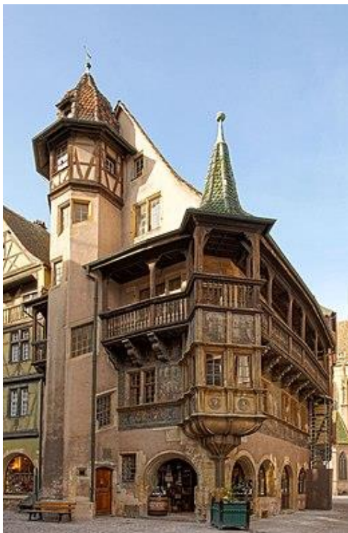
1.1. Colmar, Maison Pfister ( Pfister House ) https://en.wikivoyage.org/wiki/Colmar

According to the author herself, the book is highly visual, and Miyazaki was most likely drawn to this specific aspect when adapting it. Even though these two artists come from different cultures, both the novel and the animated version share same basis of the storyline, which still had European-inspired landscape visuals, the most prominent one being the inspiration for the look of Market Chipping which was drawn from the French city of Colmar. This is how Miyazaki used a piece of our world's social space as the inspiration and used it as a base for creating a visual representation of an entire city. This made the city feel more familiar to the western audience and easier for them to immerse themselves into this fictional world he presents. Multiple snapshots of the film depicting imaginary city, Market Chipping, showcase almost precise image of Colmar, and below is one of the many examples of it.