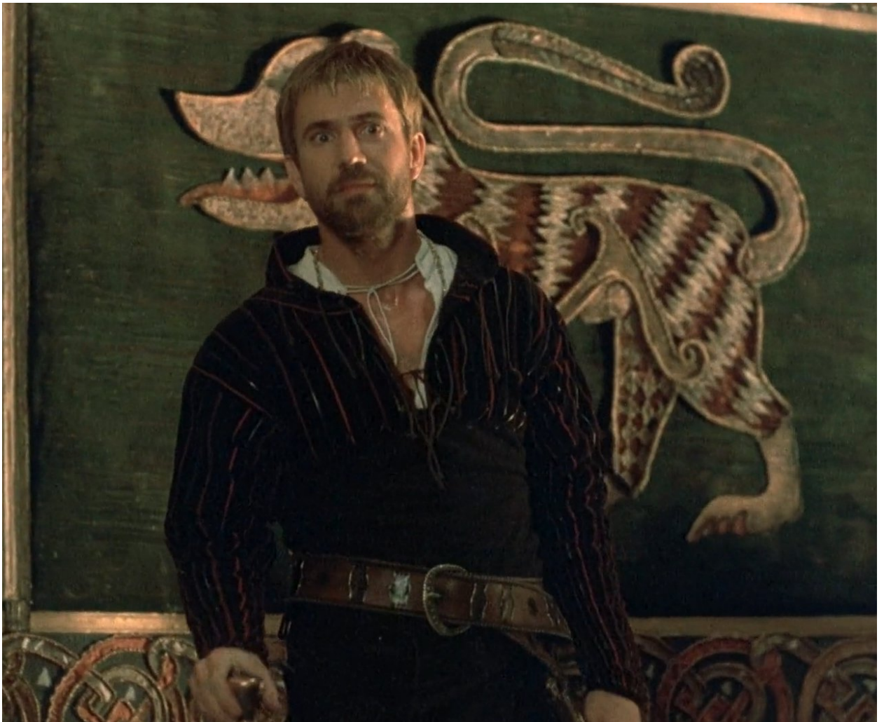
Fig. 12: “Hamlet in anger”

After building the tension, in the source text and the adaptation, Polonius hides and Hamlet finally steps into the room, immediately starting the confrontation with Gertrude. Additionally, in the adaptation Hamlet's anger is reinforced by Mel Gibson's facial expression of anger and anticipation: