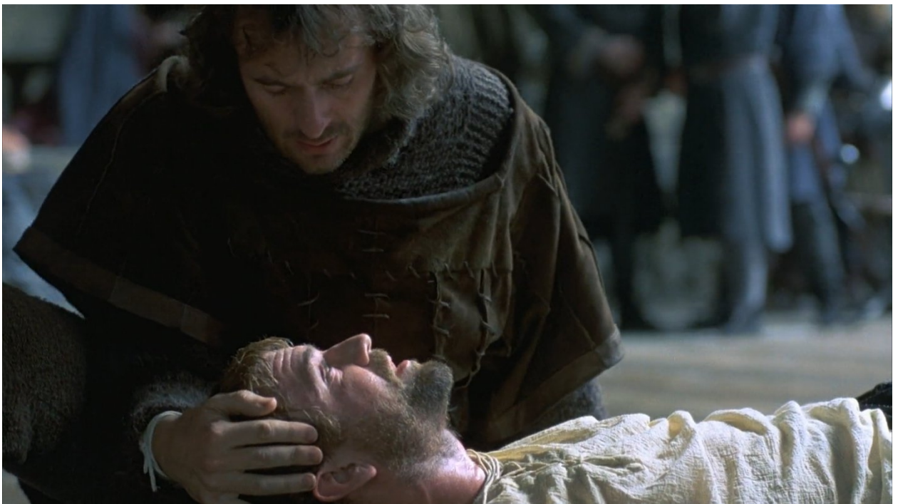
Fig. 2: "Hamlet dies in Horatio's arms"

Watson's view of the relationship between Hamlet and Horatio in Zeffirelli's offers a valuable observation. However, even though Horatio's role is noticeably reduced, the final scene between Hamlet and Horatio does not seem to indicate their estrangement. While Watson points out that the final shot where Horatio does not touch Hamlet, he omits the fact that Hamlet dies in Horatio's arms, which can be seen in a shot right before the final one: