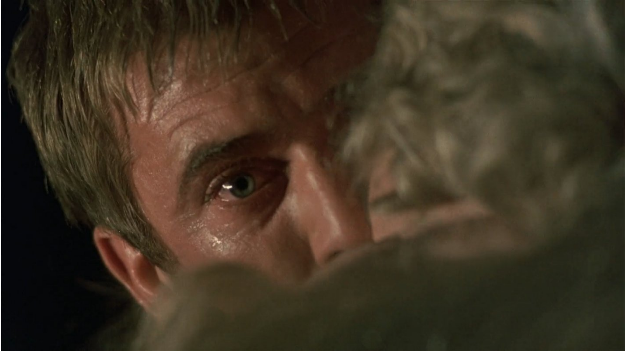
Fig. 14: “Hamlet sees the Ghost for the second time” (Source: Zeffirelli, Hamlet , 1990)

The visual juxtaposition of Gertrude's nurturing embrace, enhanced by the sound of sobs under her breath, with the ghostly figure in the background deepens the psychological complexity of the scene, illustrating how Hamlet is constantly pulled between his emotional needs and his duty. This moment not only heightens the dramatic tension but also encapsulates the tragic essence of Hamlet's character, caught in an enchanted circle of vulnerability and revenge.