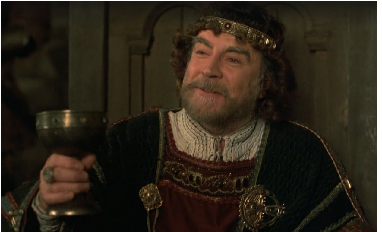
Fig. 3: “Claudius before the play” (Source: Zeffirelli, Hamlet , 1990)