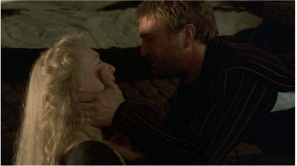
Fig. 15: “Hamlet and Gertrude in a gentle embrace”

This change of interaction is reinforced by a change in filming angle. The third-person, slightly distanced view and stable camera create a stark contrast with the previous, more erratic and close-up shots that captured the intensity of Hamlet’s initial confrontation with Gertrude. By pulling back the camera and stabilizing the frame, Zeffirelli underscores the change in Hamlet’s approach, moving from an aggressive confrontation to a more profound interaction. The subtle yet significant alterations in camera work and tone between these scenes effectively display a change in Hamlet’s approach.