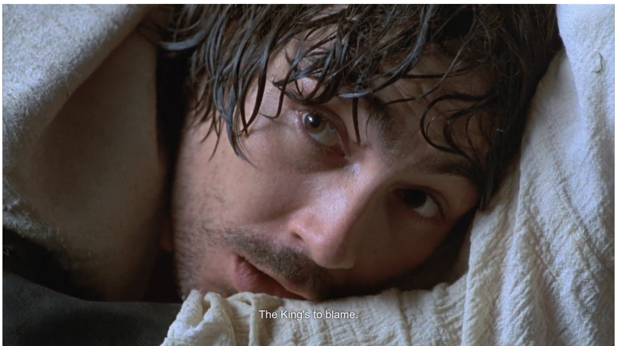
Fig. 22: "Dying Laertes"

Furthermore, the intense close-up of Laertes, burdened both by guilt and physical pain, allows the audience to perceive him as a victim rather than an avenger and Claudius' accomplice in treachery. This portrayal of Laertes, captured through the close-up of his tormented face, adds a layer of complexity to his character, transforming him from an antagonist to a tragic figure faced with the consequences of his actions. The audience witnesses his shift from vengeance to regret as he repents before his death in Hamlet's arms: