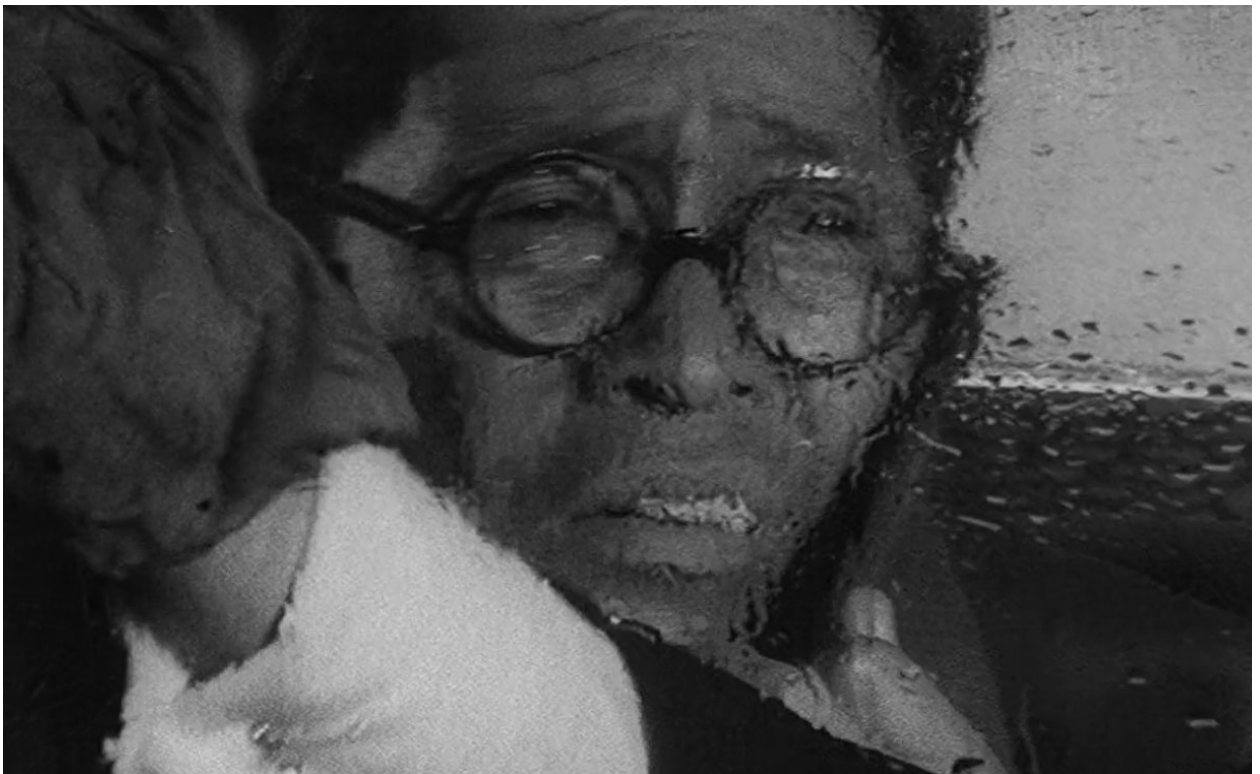
Fig. 16: "Wada on his funeral" (Source: Kurosawa, The Bad Sleep Well , 1960)

At the beginning of the scene, a combination of muted funeral chanting and Wada's face behind a blurry windshield sets the gloomy atmosphere of the scene, foreshadowing an emotionally charged revelation about to happen: