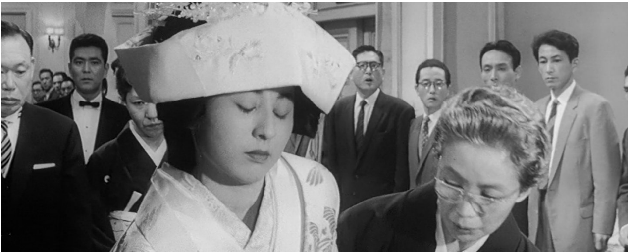
Fig. 5: “Yoshiko on her wedding day” (Source: Kurosawa, The Bad Sleep Well , 1960)

After this tense section of the scene, there is an abrupt ending of the song and a few seconds of complete silence which is a clear distinction between this and the next sequence of the scene.