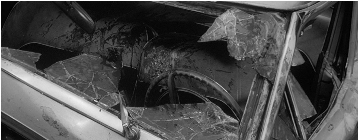
Fig. 26: “Nishi’s car”

Even though the viewers cannot see Nishi’s body, an image of a broken windshield and a car seat covered in blood represent what Nishi’s death looked like. This dreadful image, amplified with the sound of a train passing by, creates a dreadful atmosphere that amplifies the horror and finality of Nishi's death. The sharp cut to the bloodied car, combined with the unsettling sound of the train, forces the audience to confront the brutal reality of the murder without actually seeing the body. This indirect approach heightens the emotional impact, as the audience is left to imagine the violence that occurred, making it even more terrifying.