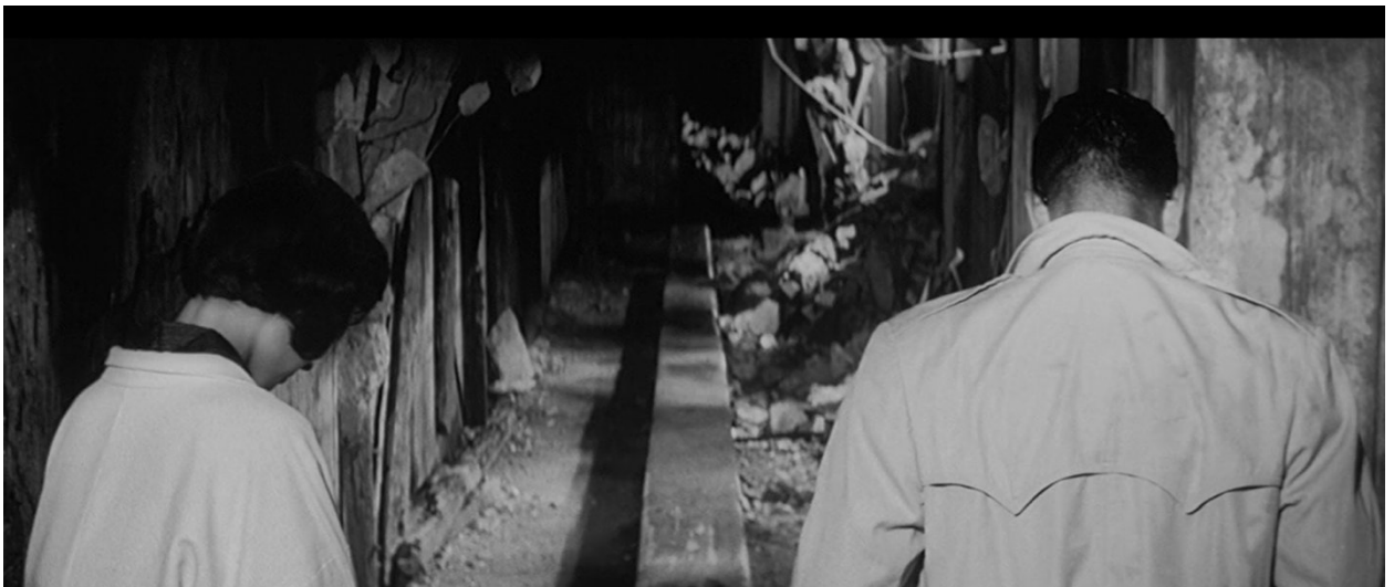
Fig. 19: “The divide between Yoshiko and Nishi” (Source: Kurosawa, The Bad Sleep Well , 1960)

Furthermore, Kurosawa opens the scene with a unique composition: