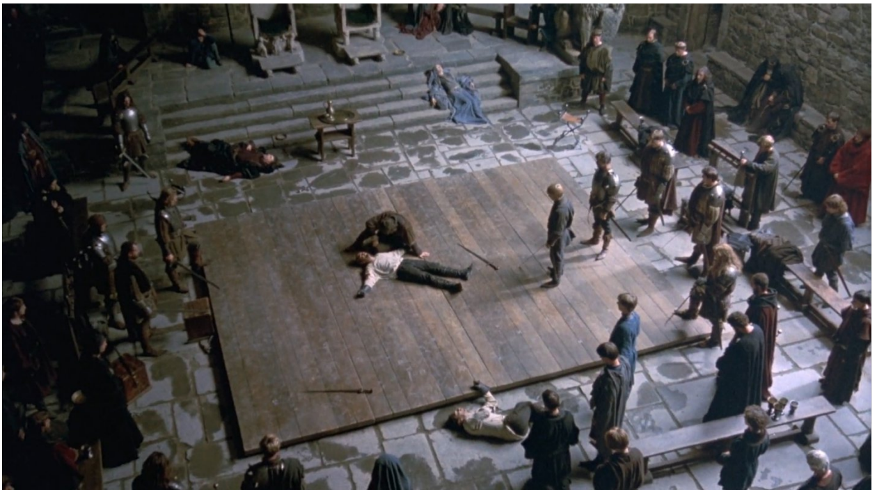
Fig. 24: "The final scene" (Source: Zeffirelli, Hamlet , 1990)

Finally, as Hamlet dies in his friend's arms, the camera films his tortured face and as he exhales his last breath, it slowly moves upwards, as if it following Hamlet's soul as it leaves his body. Lastly, the final shot slowly reveals a hall with the dead bodies of Hamlet, Gertrude, Claudius and Laertes, encapsulating a tragic ending to the story: