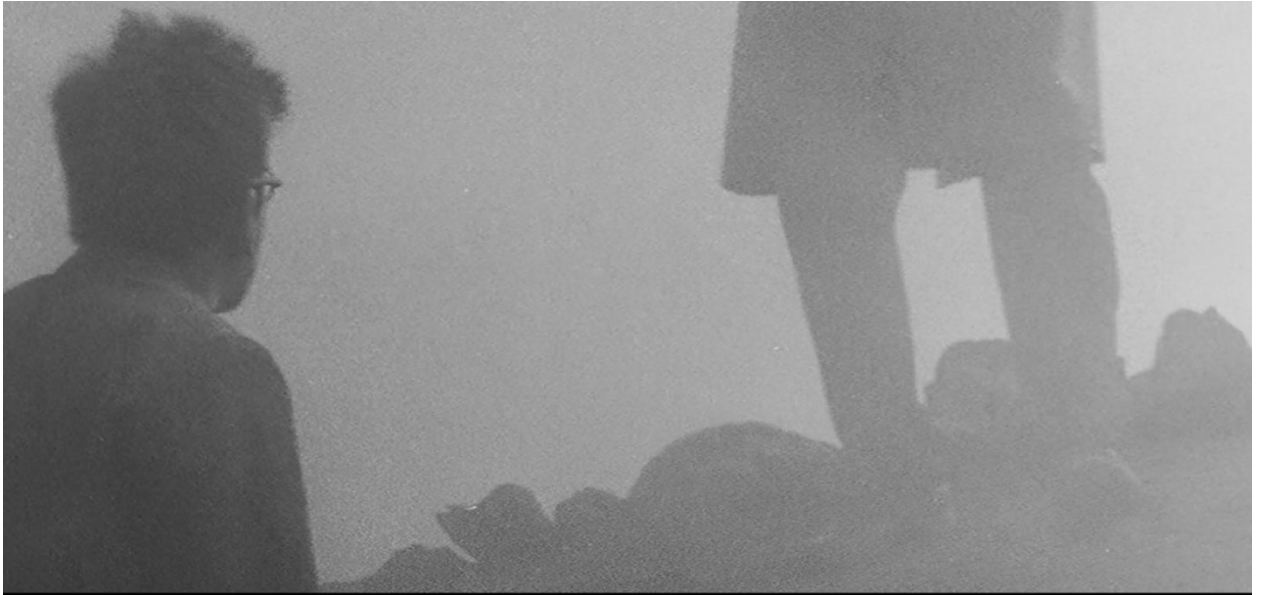
Fig. 10: “Nishi appears before Wada” (Source: Kurosawa, The Bad Sleep Well , 1960)

The gradual pace of the reveal not only heightens the mystery surrounding Nishi’s presence but also reflects Wada's shifting focus from his despair to the unexpected intrusion. As Nishi emerges from the steam, the visual contrast between his composed demeanour and Wada's bafflement underscores the power dynamic between them. This moment marks the beginning of their relationship, where Nishi's intervention becomes a turning point in Wada’s life, transforming him into a living ghost.