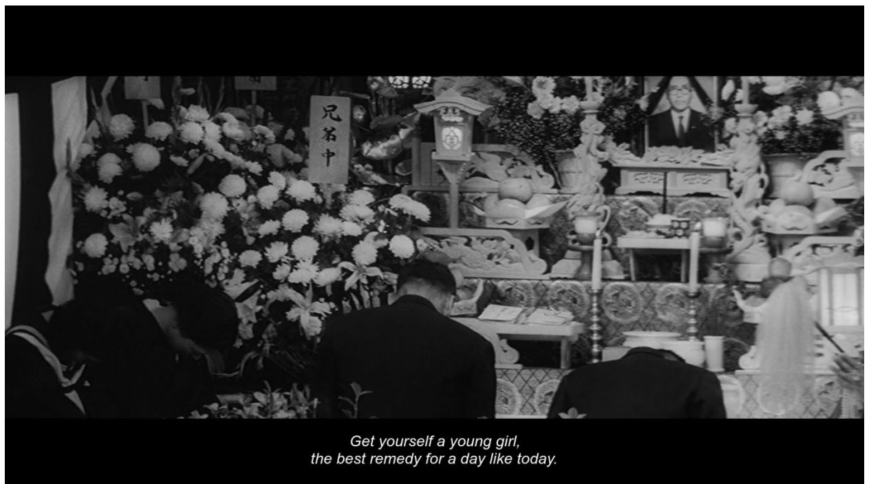
Fig. 18: "Wada's funeral" (Source: Kurosawa, The Bad Sleep Well , 1960)

However, all this is just a prelude to the climax of the scene. The arrival of Shirai and Moriyama marks the beginning of the scene's culmination. Here, Kurosawa once again uses the camera technique from the earlier part of the scene, combining a view of Shirai and Moriyama praying over Wada's casket, and Wada shivering in disbelief. This filming technique, combined with the sound of music from the tape that overpowers the funeral chant, prepares Wada and the audience for the subsequent dialogue between Shirai and Moriyama. It is important to notice that their conversation about their relief over Wada's death is just a part of their night, not something worth further discussion. Additionally, one moment best encapsulates the gravity of this scene: