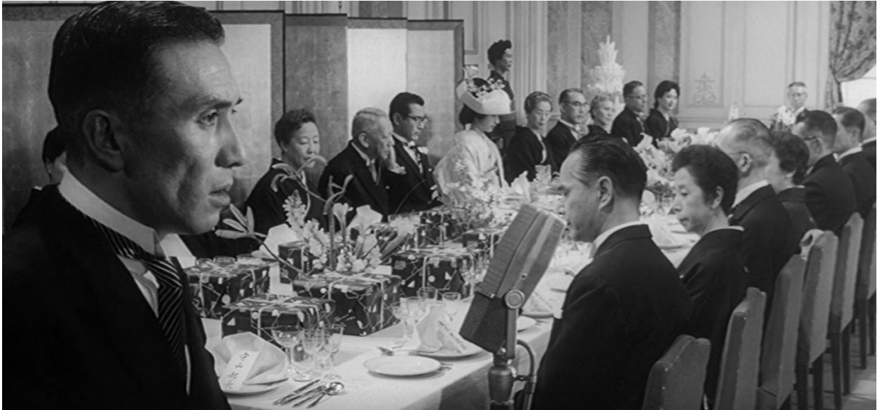
Fig. 6: “Nervous Shirai during the wedding speech”

Shirai’s nervousness on one hand and Iwabuchi’s blurred, expressionless silhouette on the other may indicate Iwabuchi’s control over Shirai who is constantly under supervision. Iwabuchi, who holds a higher position in the corporate hierarchy, remains in the background of the scene, emphasizing his distance from the immediate tension and suggesting his detachment from the situation. This visual contrast between Shirai’s anxiety and Iwabuchi’s indistinct presence underscores the power dynamics in their corporation.