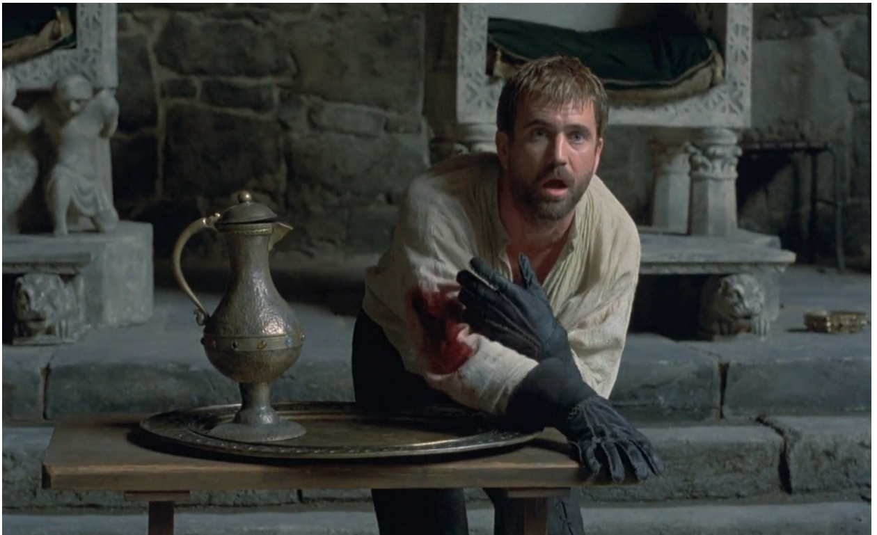
Fig. 23: "Hamlet dying" (Source: Zeffirelli, Hamlet , 1990)

Finally, Hamlet starts to succumb to the effect of the poison. However, Mel Gibson's performance makes Hamlet's agony seem more like drunkenness as he stumbles around, leaning on the table and gazing around absently: