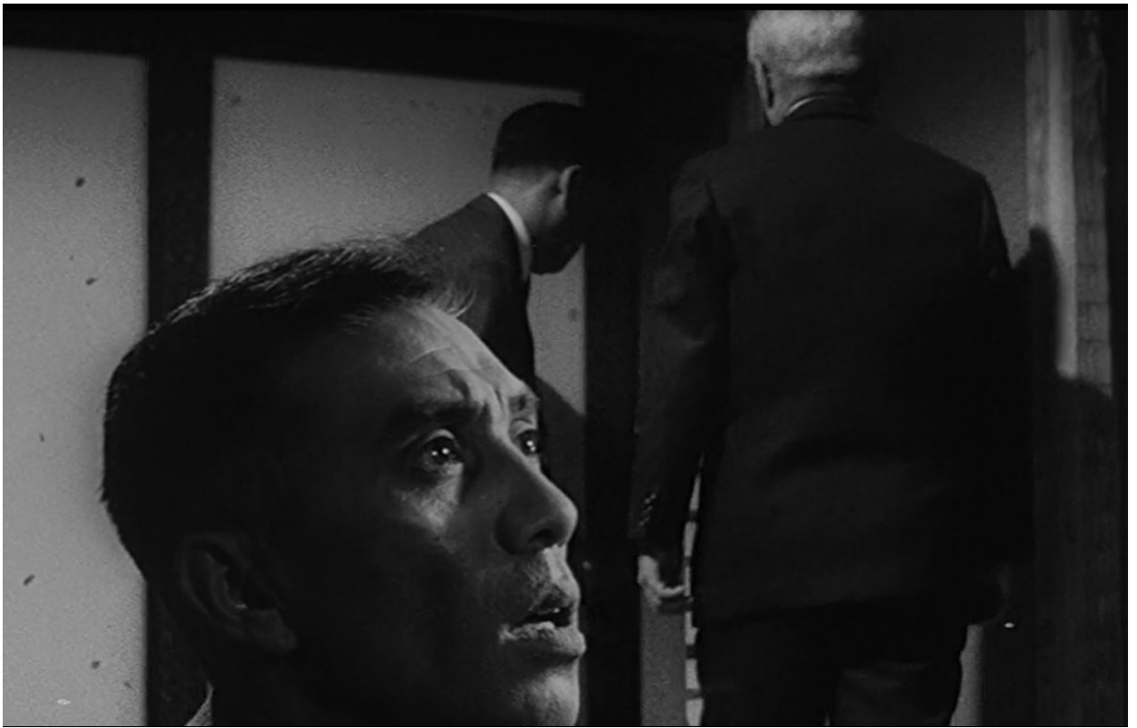
Fig. 7: “Terrified Shirai” (Source: Kurosawa, The Bad Sleep Well , 1960)

Ultimately, this scene not only continues the narrative established during the wedding but also highlights the issues of power, guilt, and the cyclical nature of violence towards the weaker individuals within the corporate world. Through this clever re-enactment, Kurosawa successfully interprets the psychological and moral decay of his characters.