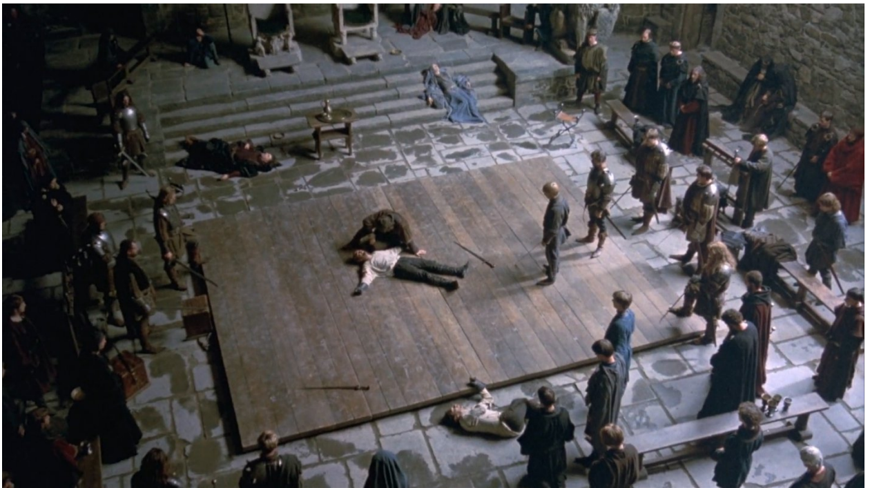
Fig. 24: "The final scene" (Source: Zeffirelli, Hamlet , 1990)

Finally, as Hamlet dies in his friend's arms, the camera films his tortured face and as he exhales his last breath, it slowly moves upwards, as if it following Hamlet's soul as it leaves his body. Lastly, the final shot slowly reveals a hall with the dead bodies of Hamlet, Gertrude, Claudius and Laertes, encapsulating a tragic ending to the story: