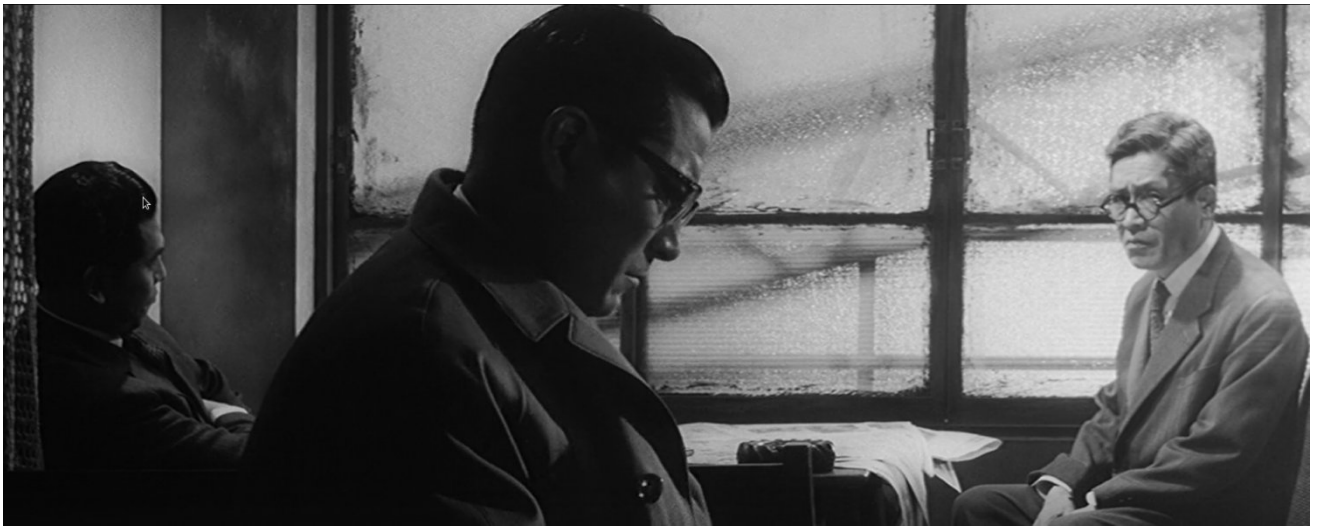
Fig. 11: “Triangular composition”

On the other hand, there is one significant similarity with Hamlet’s soliloquy – an antithesis of Nishi’s thoughts. First, Nishi says: