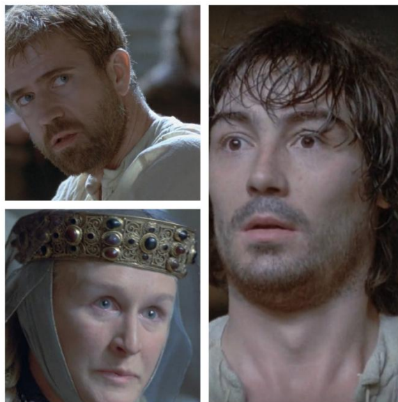
Fig. 21: "Multiple emotions"

Here, just like in Shakespeare's play, a moment when the Queen takes a sip from the poisoned chalice is a turning point in the scene. After that Laertes finally decides to wound Hamlet. However, one aspect of his decision needs to be addressed – the fact that he cuts Hamlet the moment Hamlet tries to pick up his sword. With this choice, Zeffirelli probably wants to emphasize Hamlet's reason to change his approach and fight back. This can be seen in Hamlet's perplexed reaction to a scratch that, if not poisoned, would be insignificant. The intensity of this section of the scene is amplified by a switch of the camera focus between confused Hamlet, scared Laertes and Gertrude who is dying in pain: