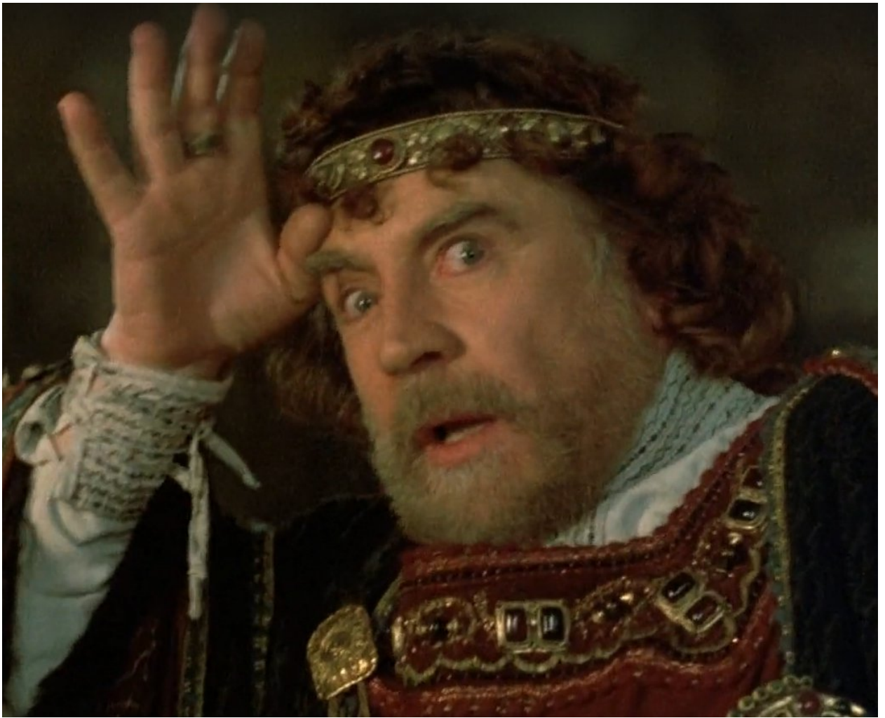
Fig. 4: “Terrified Claudius after the play”

This kind of camera work, together with the actor’s hyperbolic reactions, effectively demonstrates the intended effects of The Murder of Gonzago . The close-ups not only reveal Claudius’s guilt but also highlight Hamlet’s determination to reveal Claudius as the murderer as he analyses King’s every move. By focusing so closely on the characters’ faces, Zeffirelli amplifies the psychological and moral duel between them, making it clear to the audience that Claudius is the murderer and that he knows Hamlet is aware of it.