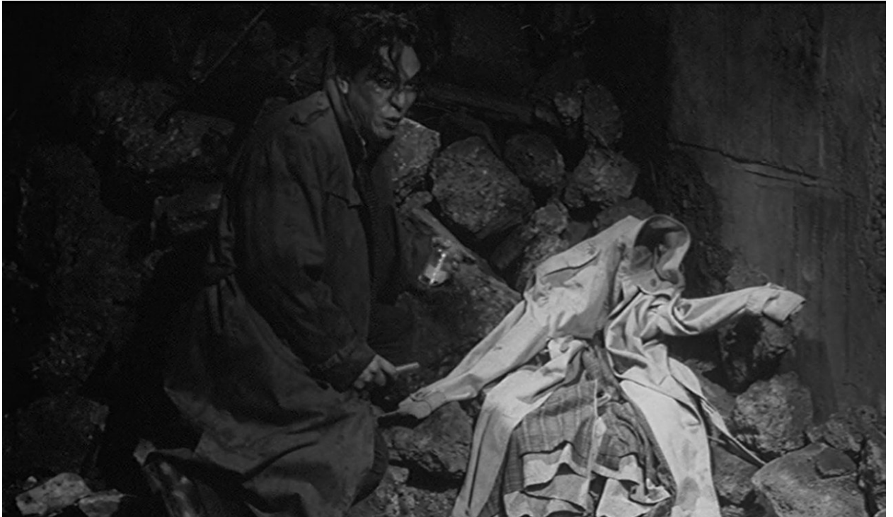
Fig. 25: "Itakura explains Nishi's death" (Source: Kurosawa, The Bad Sleep Well , 1960)

More precisely, when Itakura tries to explain Nishi's murder he focuses on the evidence he collects in the bomb shelter, a bottle of alcohol, a syringe and Nishi's coat. During this part of the scene, the camera first films Itakura's face and then moves to show the broken bottle and syringe. Then, Itakura tries to re-enact the events using Nishi's coat: