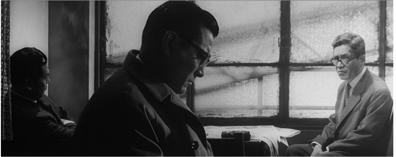
Fig. 11: “Triangular composition” (Source: Kurosawa, The Bad Sleep Well , 1960)

On the other hand, there is one significant similarity with Hamlet’s soliloquy – an antithesis of Nishi’s thoughts. First, Nishi says: