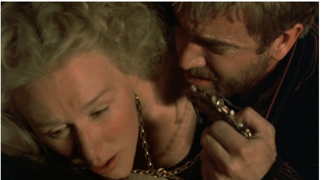
Fig. 13: "Hamlet confronts Gertrude, close-up"

However, in Zeffirelli's adaptation, this emotional distance between them is contrasted by their physical closeness. More precisely, Hamlet climbs onto Gertrude during their dispute: