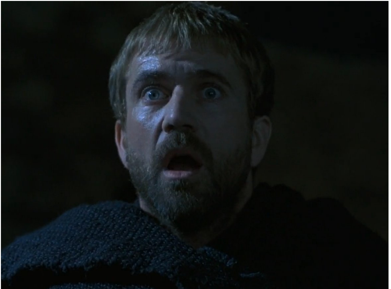
Fig. 8: “Hamlet sees his father’s Ghost”

camera work at that moment suggests that they are on different sides, Hamlet being among the living, and his father among the dead. This difference is further emphasized by Hamlet's expression of utter shock and the Ghost's lack of reaction. In addition, Mel Gibson's astounding performance, especially when he gasps in astonishment and nearly goes mute, captures Hamlet's overwhelming mix of fear and disbelief. The combination of precise camera work, strategic use of light and shadow, and Gibson's powerful acting intensifies the level of suspense, helping the audience feel Hamlet's fear.