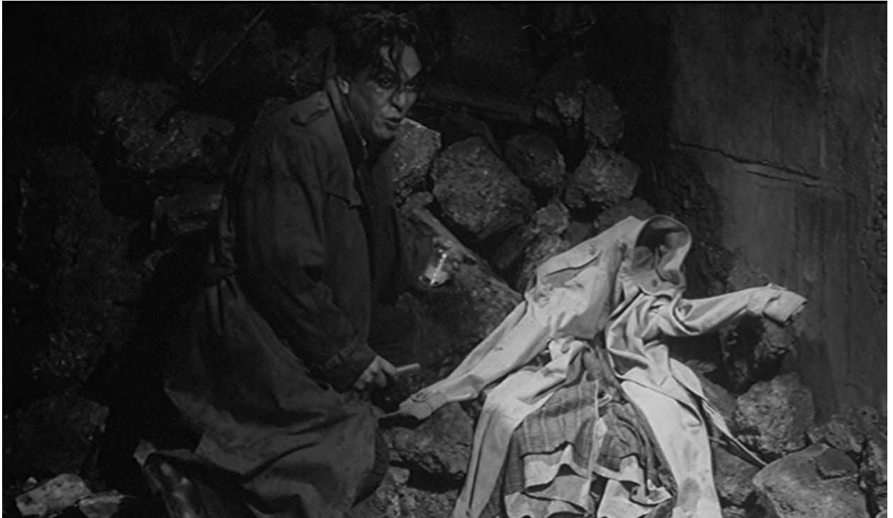
Fig. 25: "Itakura explains Nishi's death" (Source: Kurosawa, The Bad Sleep Well , 1960)

More precisely, when Itakura tries to explain Nishi's murder he focuses on the evidence he collects in the bomb shelter, a bottle of alcohol, a syringe and Nishi's coat. During this part of the scene, the camera first films Itakura's face and then moves to show the broken bottle and syringe. Then, Itakura tries to re-enact the events using Nishi's coat: