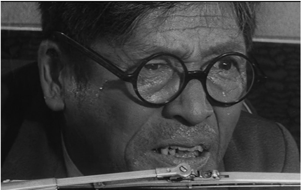
Fig. 17: "Wada in agony"

In the continuation of the scene, a combination of two camera angles creates an emotionally tense moment for Wada and presents it to the audience. First, the camera films the funeral from Wada's point of view, following his gaze directed at his framed picture and funeral attendees and then switches to his face to reveal an expression of horror. Then, the camera switches back to his point of view to reveal his family sitting by his casket and crying, only to show his face again, displaying even more agony: